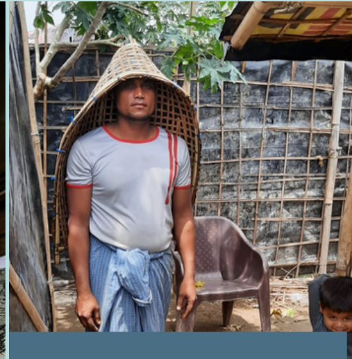
Scenes from the camps